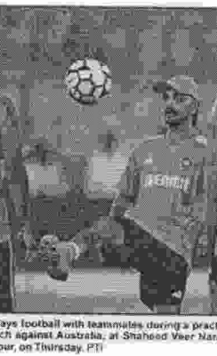
India's Ishan Kishan plays football with teammates during a practice session ahead of the fourth T20I cricket match against Australia, at Shreeadh Veer Narayan Singh International Stadium, in Raipur, on Thursday.

The likes of Jason Behrendorf, Kane Richardson and Nathan Aspinall could find the going tough on most days. So far, the unenviable conditions meant the series has been a nightmare for the bowlers with the 200-plus totals in six ODI, and the band is expected to continue in the remainder of the